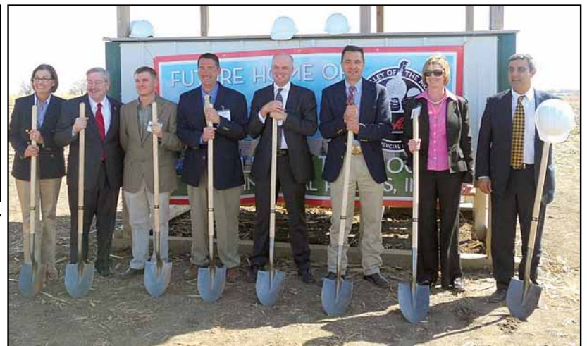
Groundbreaking ceremony attendees included Lt. Governor Kim Reynolds, Governor Brandstad, and officials from Aviagen and Valley of the Moon.

Valley of the Moon is a division of Aviagen Turkeys, which is headquartered in West Virginia.