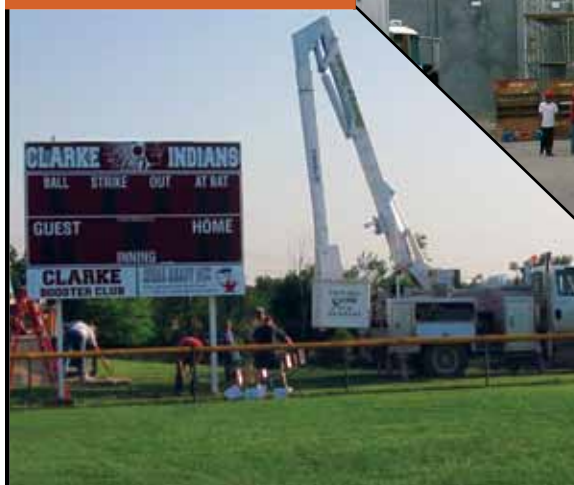
Above: Work continues on the new Valley of the Moon Commercial Poults, Inc., building.