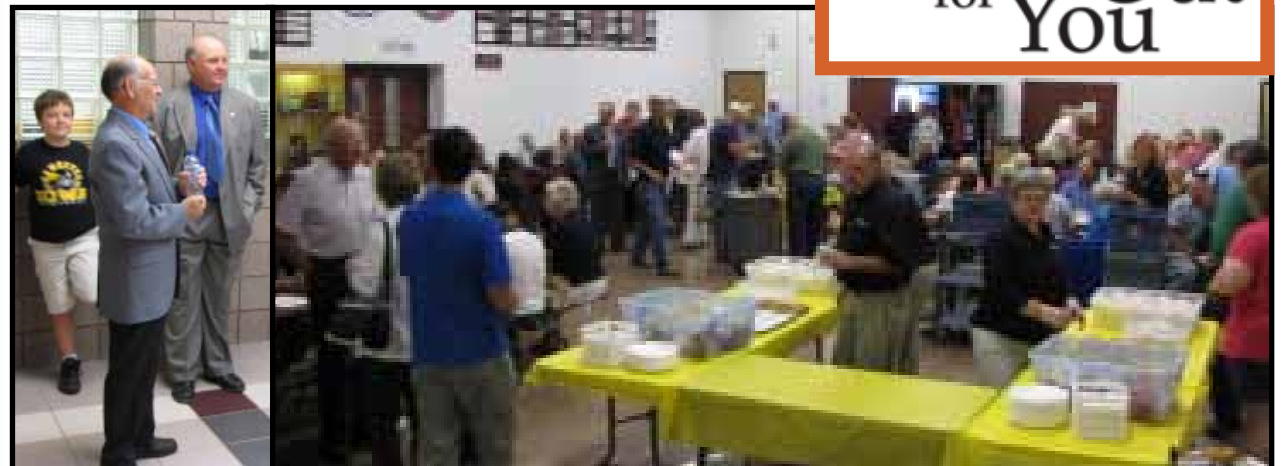
Board members were present to greet and network with members who attended the annual meeting in September. All who attended enjoyed a free pork-sandwich dinner provided by the Madison County Pork Producers.